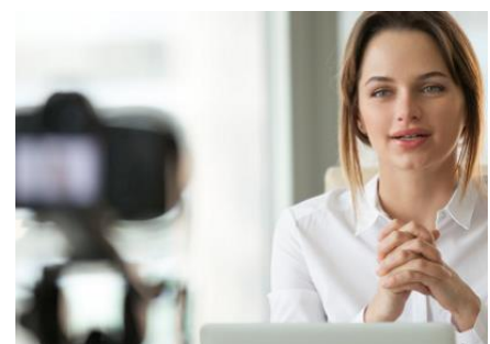
Teaching Online for the Classroom Teacher