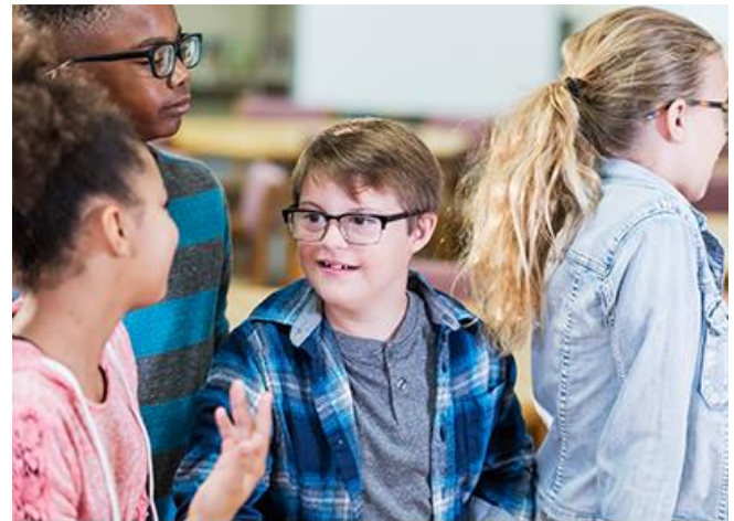
Students with Disabilities University of North Dakota

It also aligns to all of the McRel Teacher Evaluation Standards including Teacher Leadership, Diverse Learners, Teachers Know Content, Teachers Facilitate Learning and Teachers Analyze and Reflect.