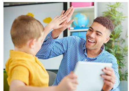
Raising Academic Achievement