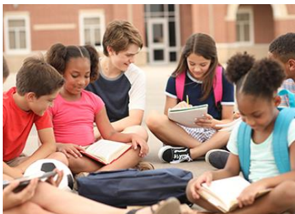
Reading Across the Curriculum