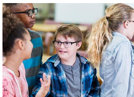
Student with Disabilities