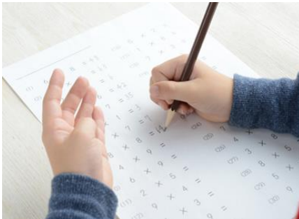
Cognitive Skills Understanding Learning Challenges