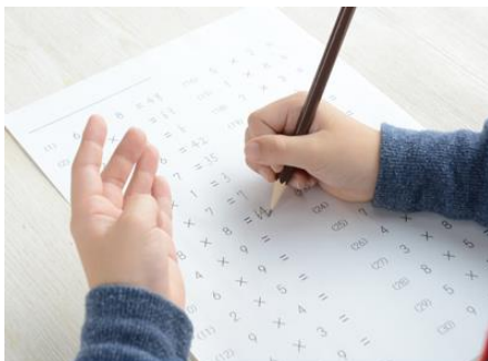
Cognitive Skills Understanding Learning Challenges