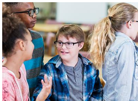
Students with Disabilities