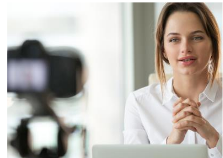
Teaching Online for the Classroom Teacher