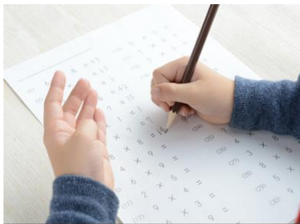
Cognitive Skills Understanding Learning Challenges