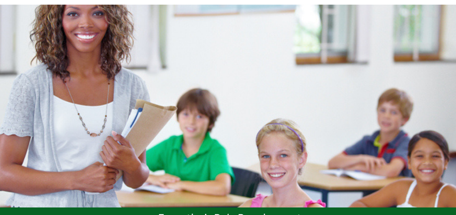
Executive's Role Requirement