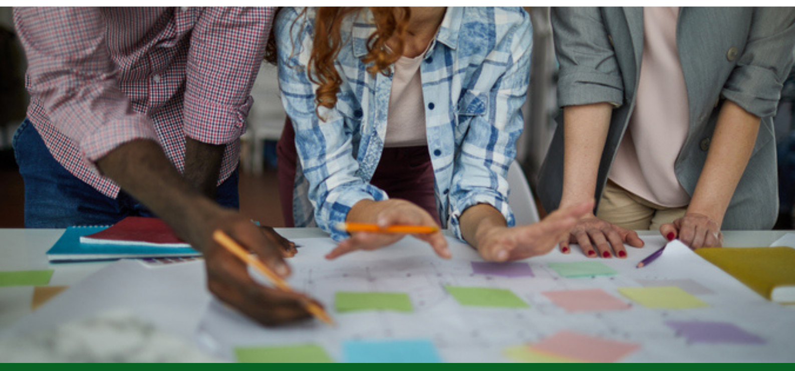
Executive's Role Requirement (includes project)

This course prepares school leaders to implement hybrid learning in the areas of online teaching and learning, technology and infrastructure, safety protocols, parent partnerships, and PD.