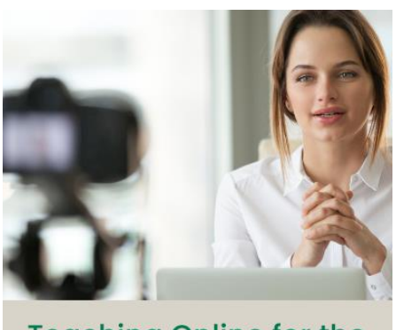
Teaching Online for the Classroom Teacher