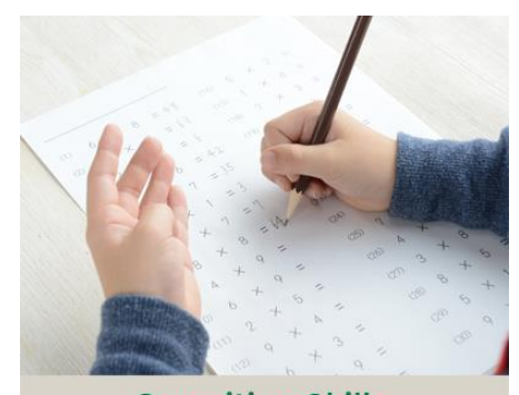
Cognitive Skills Understanding Learning Challenges

MD Recertification Package (6 Credits - Adams State University)