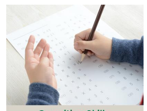
Cognitive Skills Understanding Learning Challenges