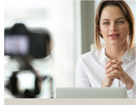
Teaching Online for the Classroom Teacher