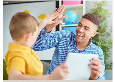
Raising Academic Achievement