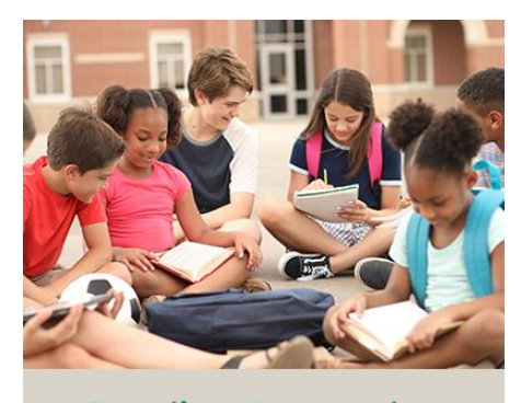
Reading Across the Curriculum